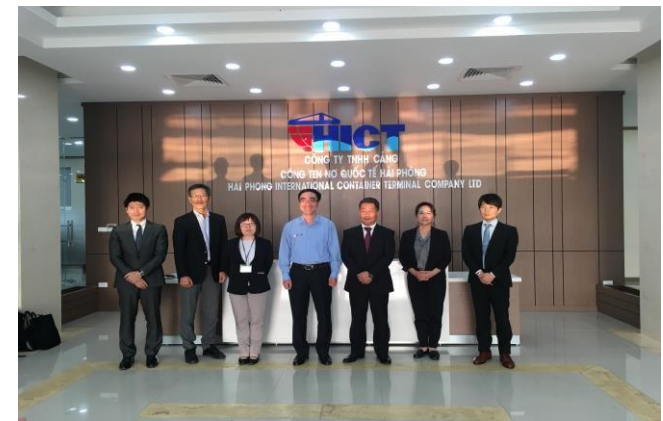
Interpretation at Hai Phong Port.