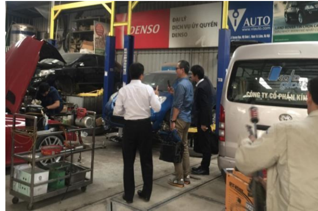
Interpretation at an automobile repair workshop.