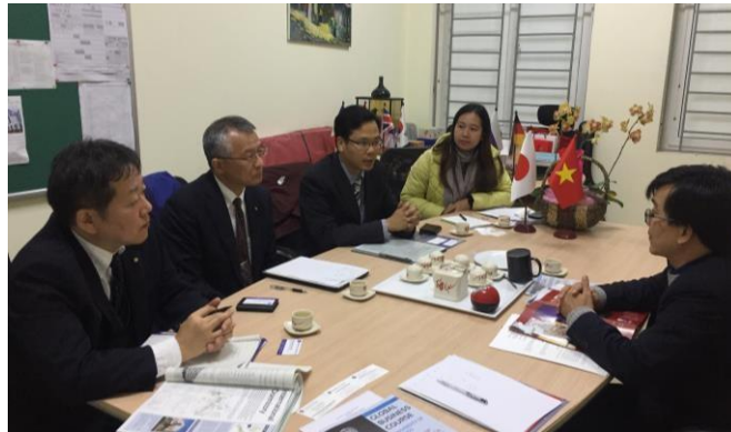
Interpretation in the education field.