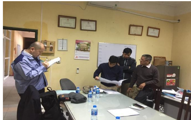
Interpretation during installation of technical equipment.