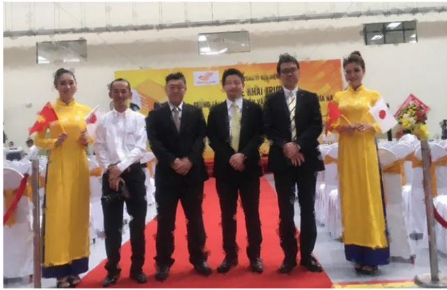
Interpretation at an opening ceremony.