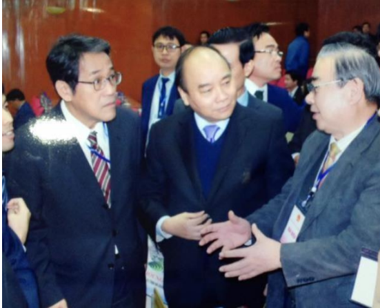
Interpreter of Prime Minister and Ambassador Extraordinary and Plenipotentiary of Japan to Vietnam, etc.