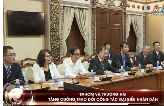
Interpreter of Senior Delegation Officials of Shanghai City.