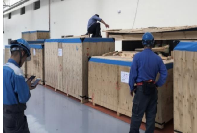
Interpretation during installation of a goods automated sorting system.