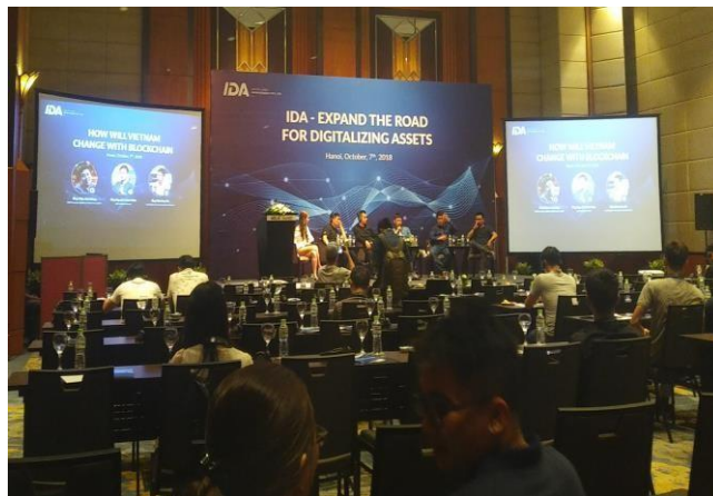
Simultaneous interpretation at an investment seminar.