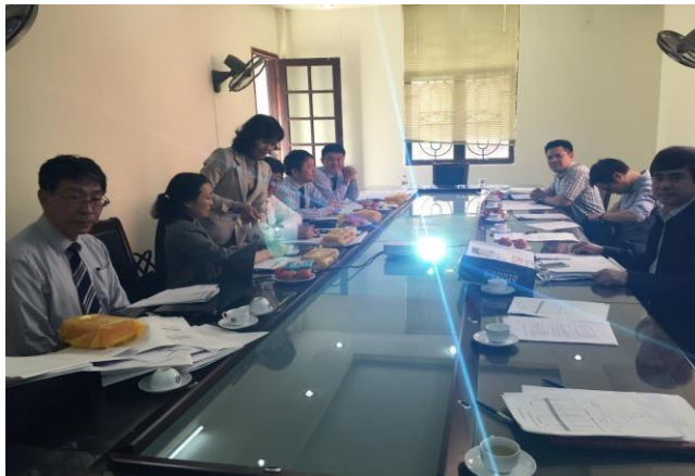
Interpretation in the real estate field.