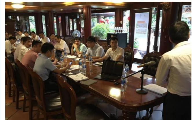
Interpretation at trade negotiations.