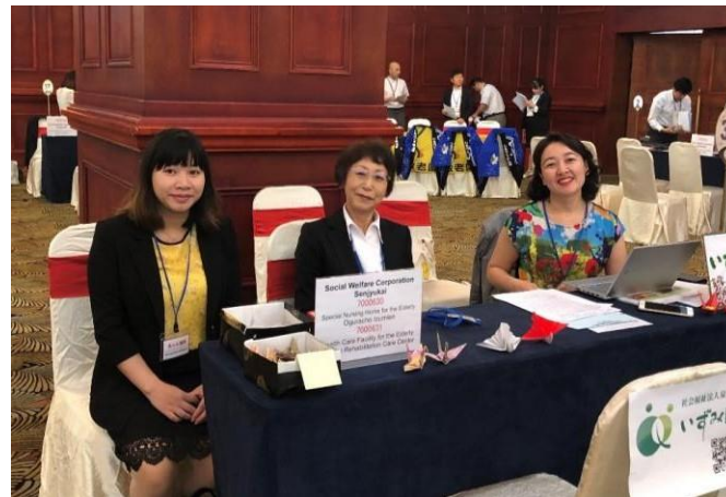
Interpretation at a nursing careers event.