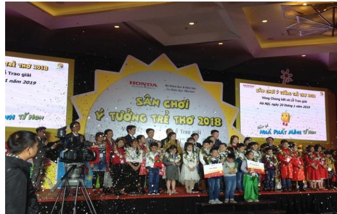
Simultaneous interpretation during Honda Children's Idea Contest.