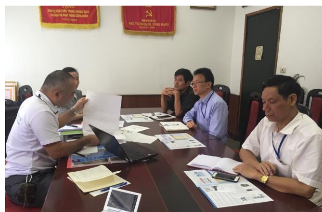
Interpretation during a business discussion.