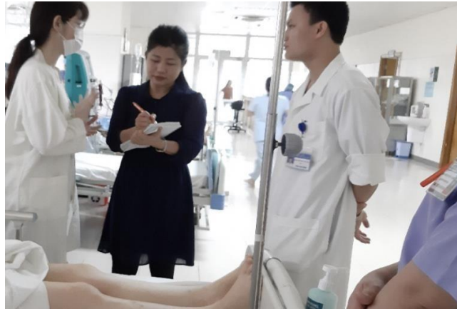
Interpretation in the medical field.