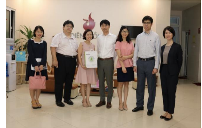
Interpretation during a nursing home visit.