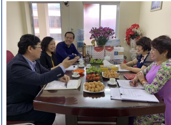
Interpretation during an official visit.