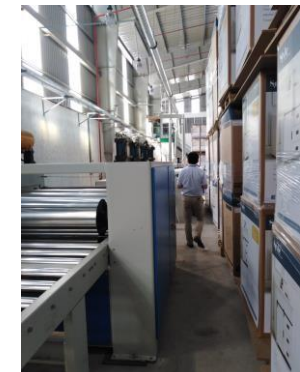
Interpretation at a factory.