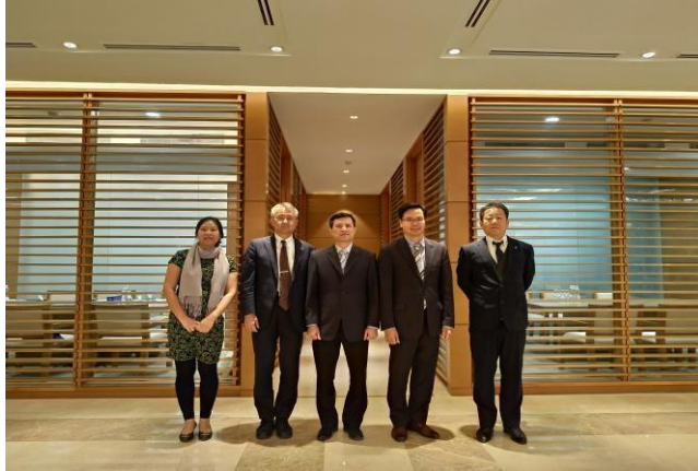
Interpreters for senior leaders.