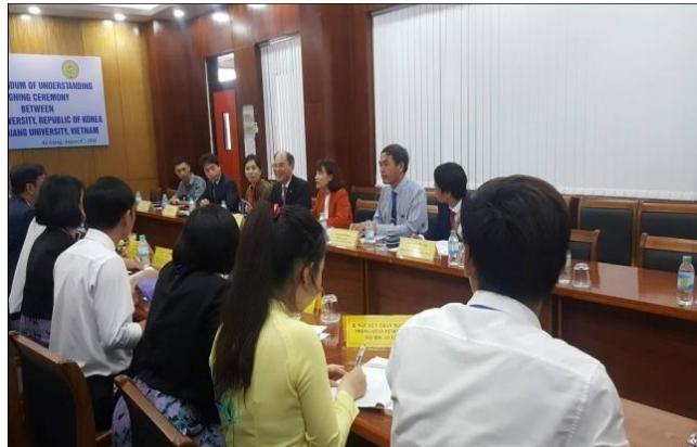
Interpretation for a conference between two universities.