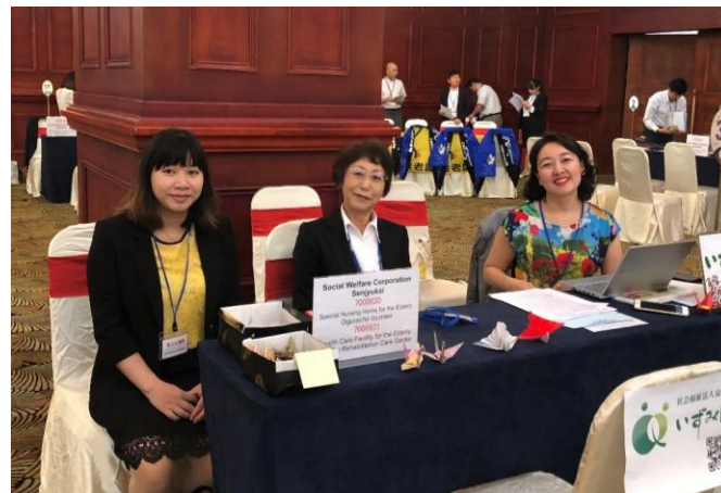
Interpretation at a nursing careers event.