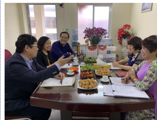
Interpretation during an official visit.