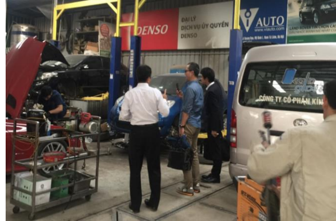
Interpretation at an automobile repair workshop.