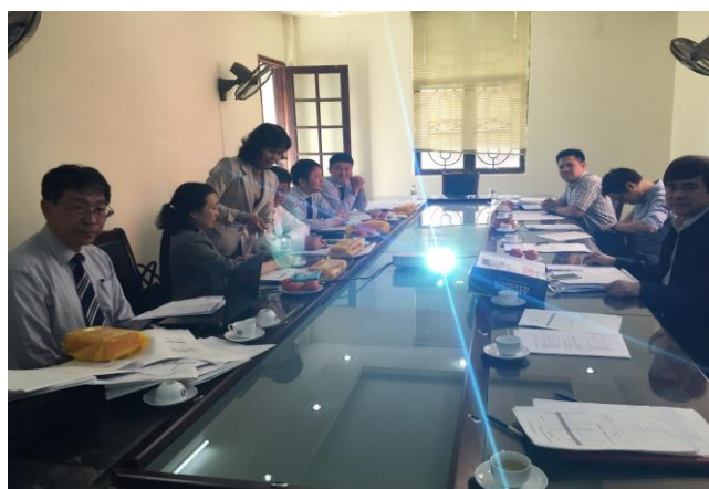
Interpretation in the real estate field.