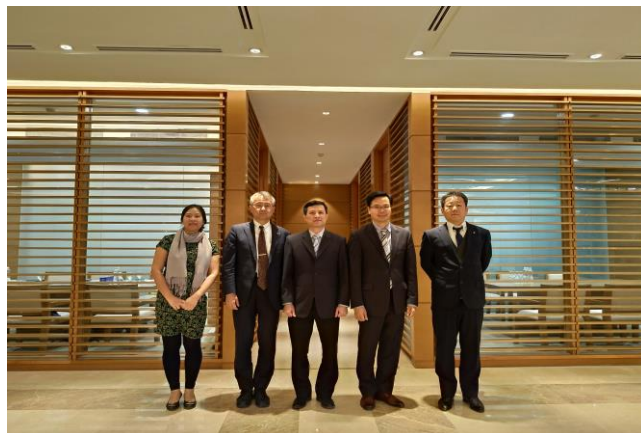
Interpreters for senior leaders.