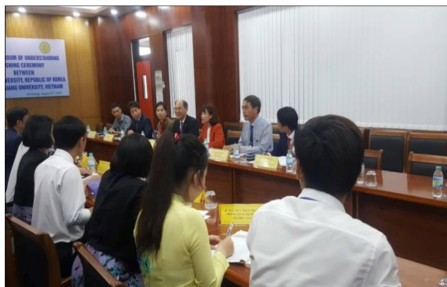
Interpretation for a conference between two universities.