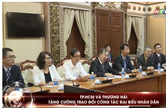
Interpreter of Senior Delegation Officials of Shanghai City.