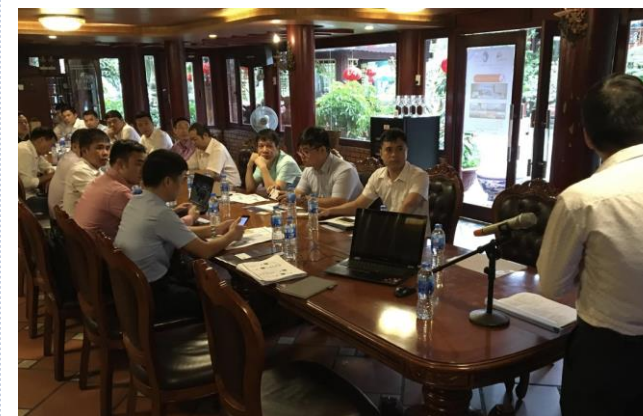
Interpretation at trade negotiations.