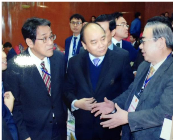
Interpreter of Prime Minister and Ambassador Extraordinary and Plenipotentiary of Japan to Vietnam, etc.