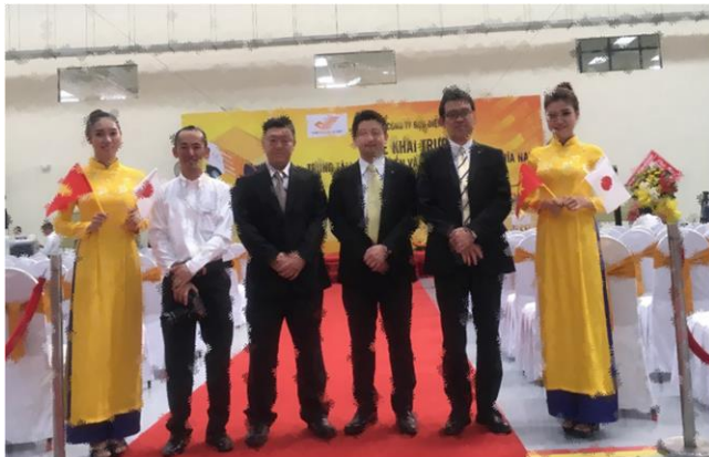
Interpretation at an opening ceremony.