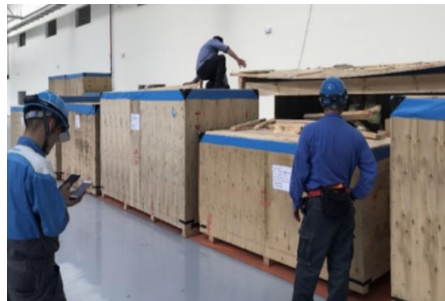
Interpretation during installation of a goods automated sorting system.