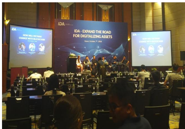
Simultaneous interpretation at an investment seminar.