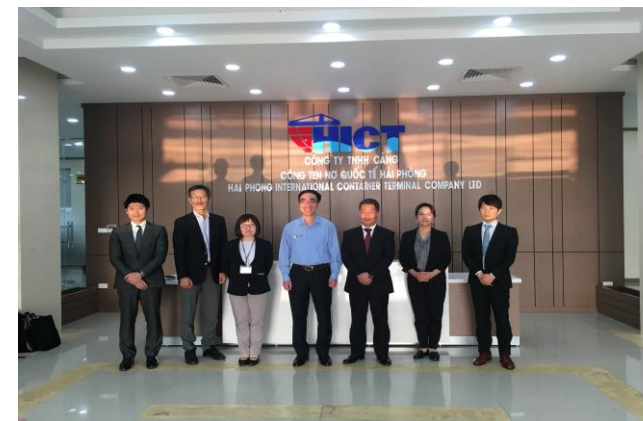
Interpretation at Hai Phong Port.