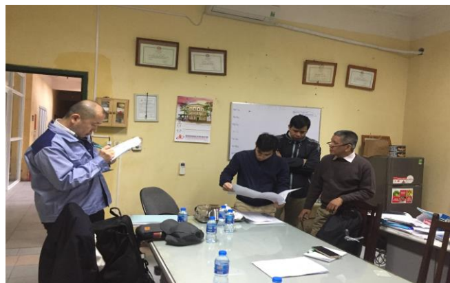
Interpretation during installation of technical equipment.