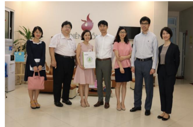
Interpretation during a nursing home visit.